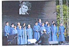
Boy choristers—Outdoor Concert

We are holding 'Come and See' sessions for girls aged 8 - 15 and boys aged 6 - 11 to join our choristers