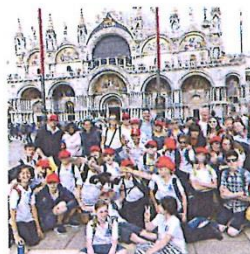
Quick photo before singing in St. Mark's Basilica in Venice!!