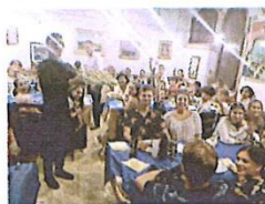
Choir meal - anyone for ice cream?