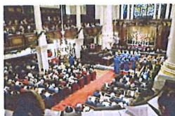
Concert at St. George's, Hanover Square

'Come and See' the great benefits of being a Chorister!