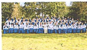
Choirs of St. Thomas-on-The Bourne